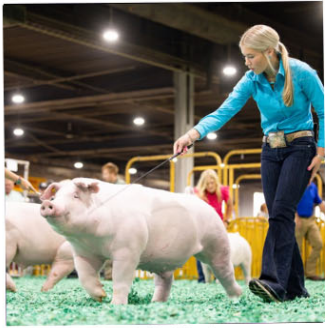
Bristol Hopkins Grand Champion Chester White, 3rd Overall Market Hog