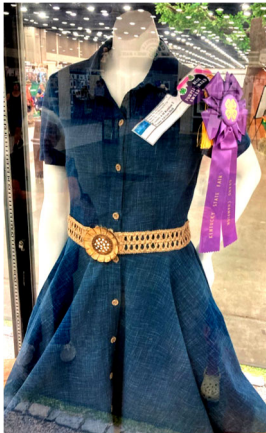
Adrian Doll Sewing

Kenton County Extension 10990 Marshall Road Covington, KY 41015 (859) 356-3155