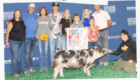
Bristol Hopkins Reserve Champion Spot Market Hog