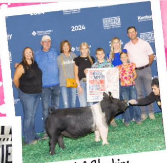
Bristol Hopkins Reserve Champion Duroc Market Hog