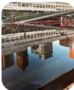
Anna Donahue FCS Photography