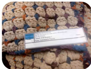
Annemarie Fuerst Crochet