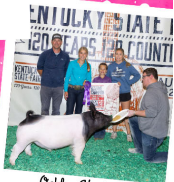
Oakley Hopkins Reserve Champion Lightweight Crossbred Market Hog