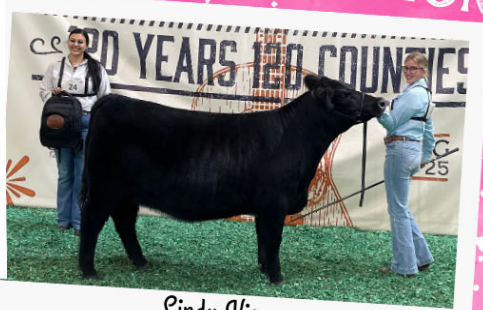
Lindy Kiser Reserve Shorthorn Plus Heifer, Reserve Overall Heifer